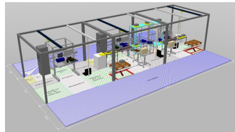
Fig. 2: Implementation and simulation of an exemplary assembly process